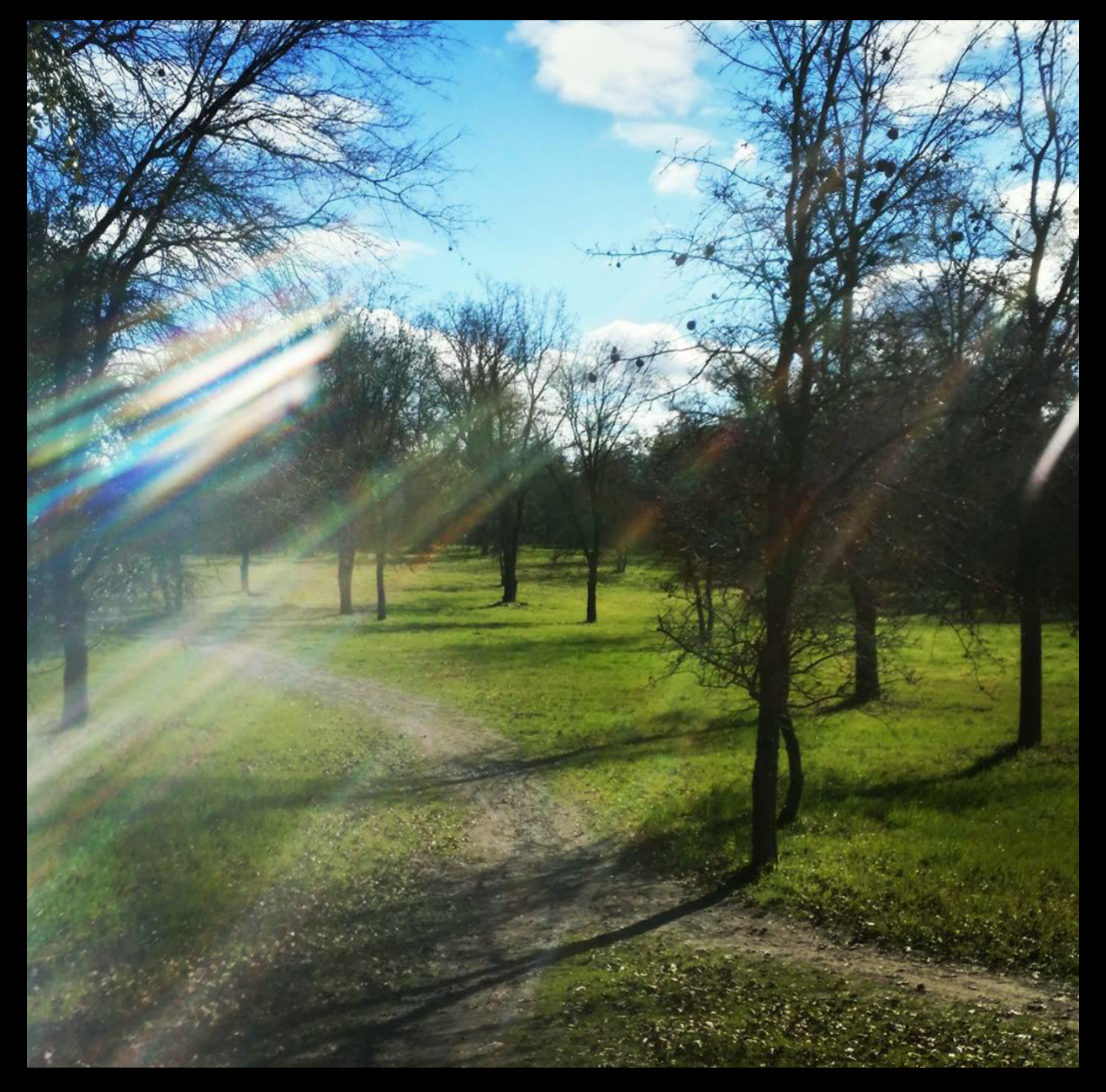
A single photograph that is part of a series of picture taken attempting to capture natures beauty.